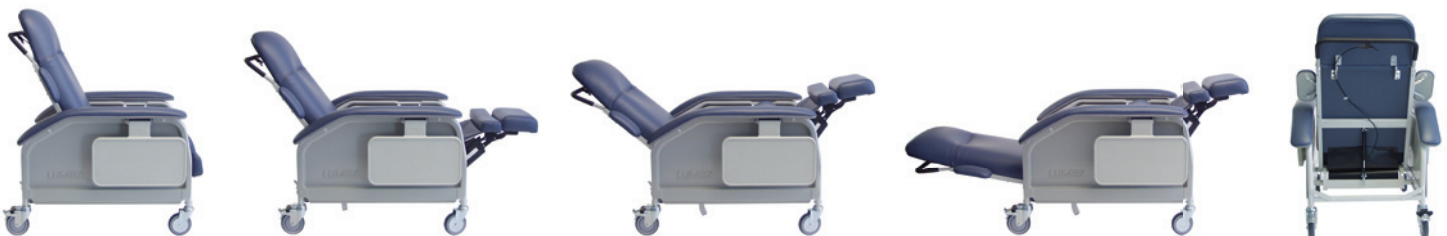
Infinite Position Back Design

LiquiCell is an ultra-thin, liquid-filled interface specifically designed and proven to significantly reduce shear stress, aiding in the prevention of pressure sores and general discomfort.