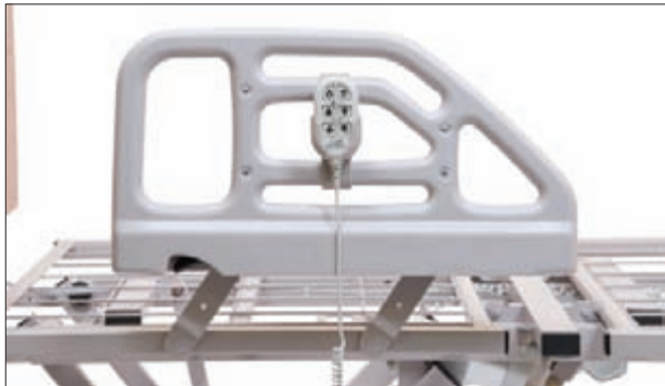
Warm-to-the-touch Half Length Assist Device ZA84200

Optional Half Length Assist Device and Assist Bars provide a sturdy and secure hand hold to assist residents in and out of bed. Assist devices are removable without tools and meet FDA Entrapment Guidelines.