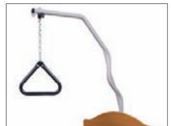
ZA79000 (for use with ZA78100 Trapeze Bar)

Optional trapeze adapter allows for easy attachment of trapeze system to headboard within easy reach for residents for repositioning themselves.