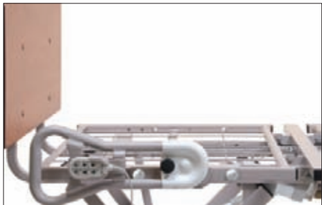
Pivot Assist Bar ZA85400 (tool-less) ZA87900 (bolt-on)