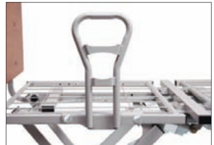
Fixed Assist Bar ZA85000 (tool-less) ZA87800 (bolt-on)