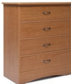
Four Drawer Dresser W- 30", D-18", H-34" A37-22 Shown with Crescent Cut-Out Front Kick Plate