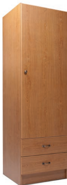
Two Door Two Drawer Wardrobe W- 24", D-22", H-78" B02-22 Shown with Closed Front Kick Plate