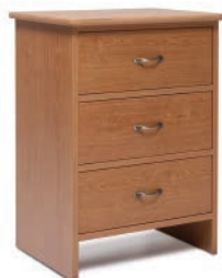
Three Drawer Bedside Chest W- 21", D-18", H-30" A31-22 Shown with Open Kick Plate