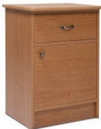
Door/Drawer Bedside Cabinet W- 21", D-18", H-30" A30-22 Shown with Closed Front Kick Plate