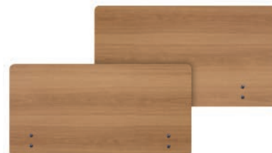
Head & Foot Board A633 See Head and Foot Board Options