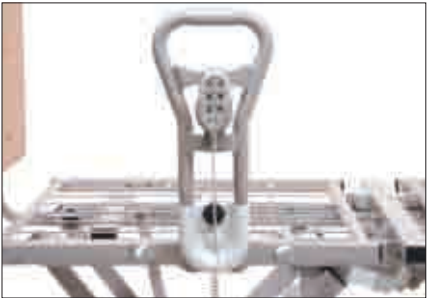
Fixed Assist Bar ZA85000 (tool-less) ZA87800 (bolt-on)