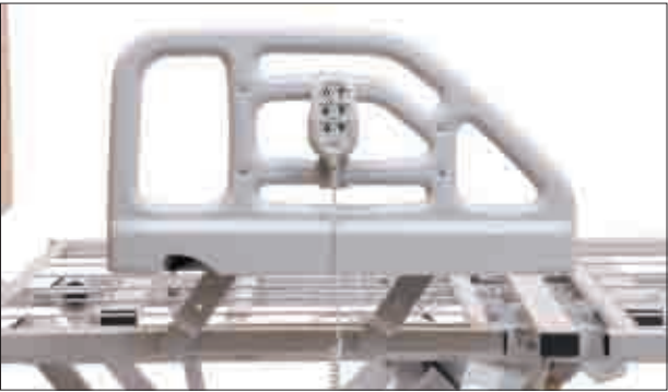
Warm-to-the-touch Half Length Assist Device ZA84200

Optional Half Length Assist Device and Assist Bars provide a sturdy and secure hand hold to assist residents in and out of bed. Assist devices are removable without tools and meet FDA Entrapment Guidelines.