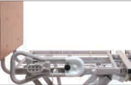
Pivot Assist Bar ZA85400 (tool-less) ZA87900 (bolt-on)