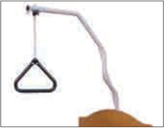
ZA79000 (for use with ZA78100 Trapeze Bar)

Trapeze Adapter Optional trapeze adapter allows for easy attachment of trapeze system to headboard within easy reach for residents for repositioning themselves.