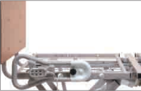
Pivot Assist Bar ZA85400 (tool-less) ZA87900 (bolt-on)