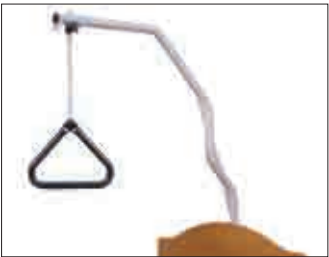
ZA79000 (for use with ZA78100 Trapeze Bar)

Optional trapeze adapter allows for easy attachment of trapeze system to headboard within easy reach for residents for repositioning themselves.