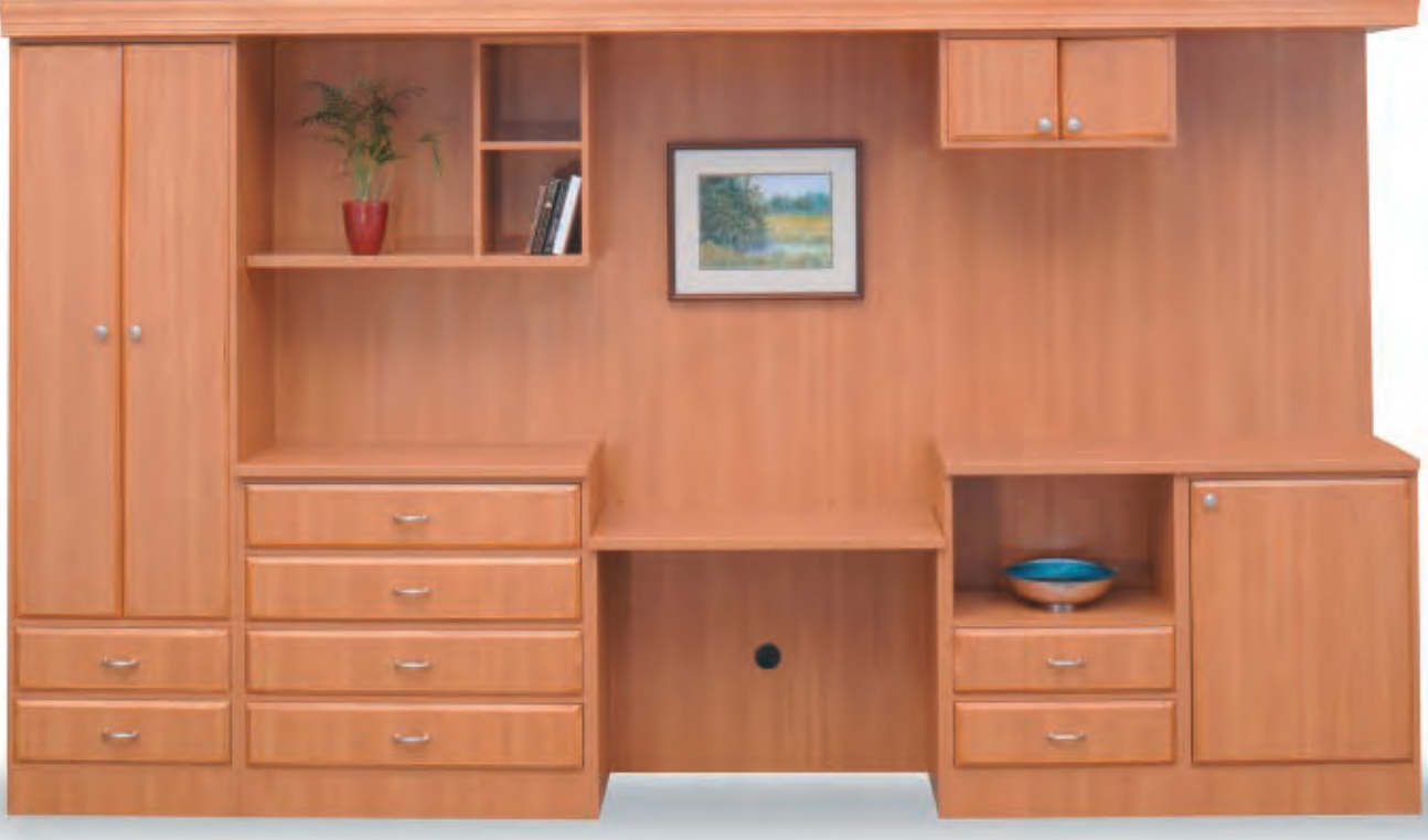
The Oak Park Collection