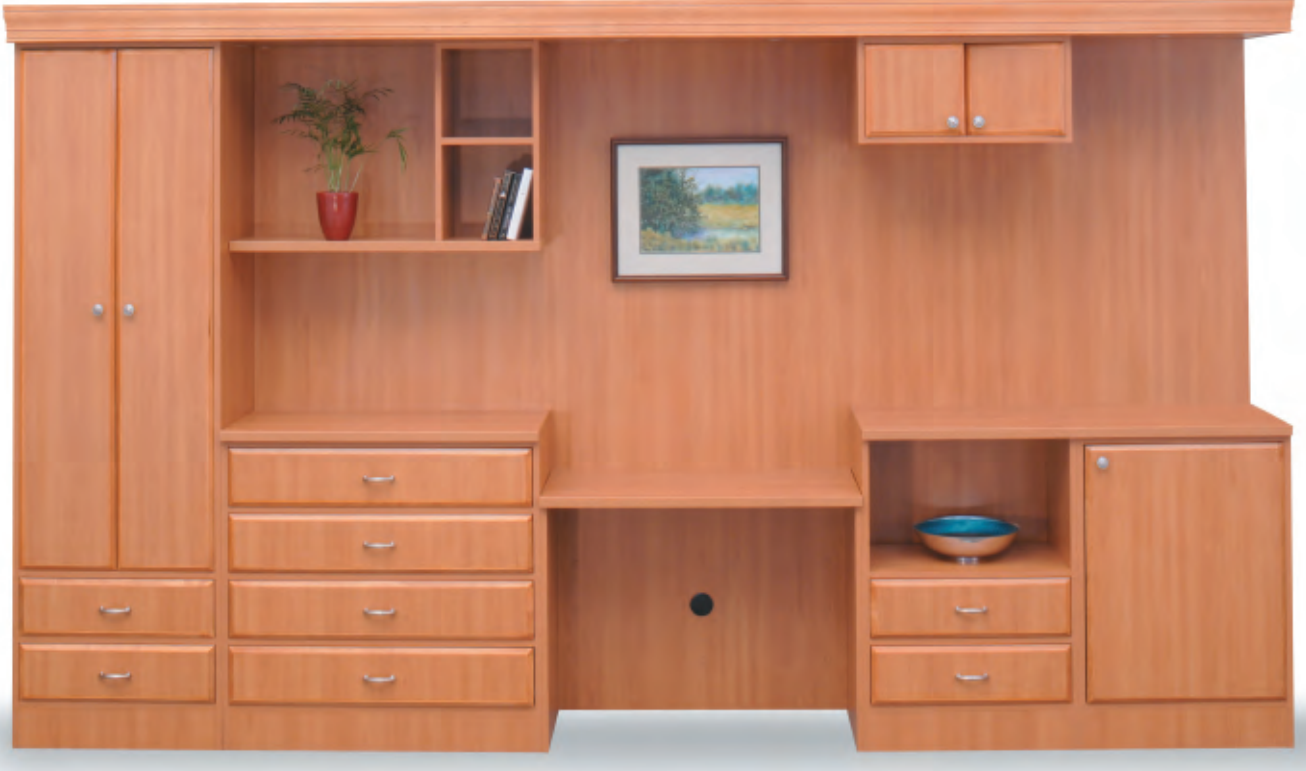
The Oak Park Collection