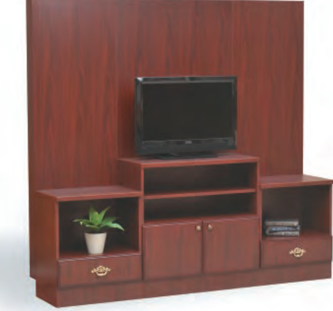
Flexibility allows modular components to be used in many areas within a facility.