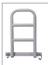
ZA80300 Fixed Assist