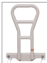
ZA85000 Fixed Assist