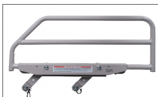
ZA78400 and ZA82800 Counter-rotating Assist Device