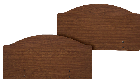
Center Crown laminate panel with T-Mold Edge