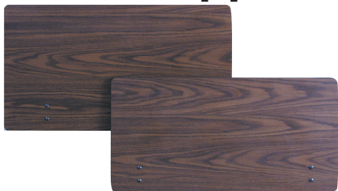
Rectangular laminate panel with T-Mold Edge

Get these fine quality beds and accessories shipped* within 3 business days!