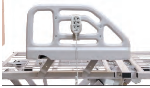
Warm-to-the-touch Half Length Assist Device ZA84200