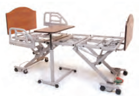
Maximum underbed clearance for use with overbed tables and lifts.