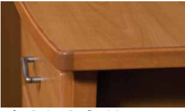
Scandinavian styling. Rounded corners. Available with matching or contrasting door/drawer finishes.