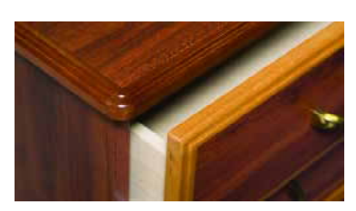
Frame-style door and drawer fronts Rounded corners.

Surface: Laminate Top Edge: Wood, ogee edge Door/Drawer Front Edges: Wood, ogee edge Drawer Style: Inset