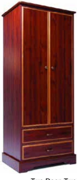
Two Door, Two Drawer Wardrobe B021-52