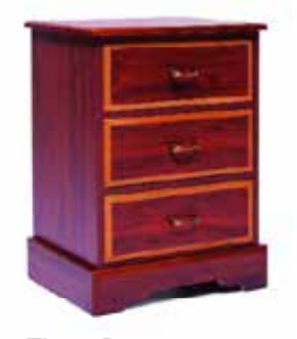
Three Drawer Bedside Chest A31-52