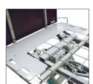
Length Extension Kit ZA90840 4" extension