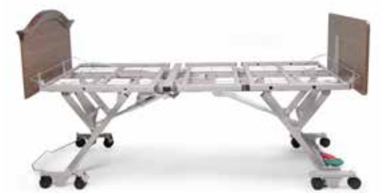
High Position Height Travel Range: 27"