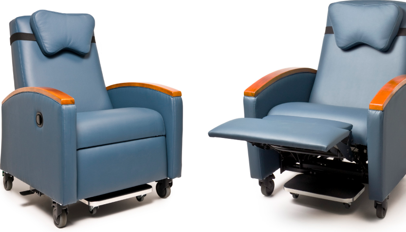
FR597G Lumex® Ortho-Biotic™ II Recliner with wood trimmed arms