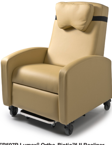
FR597P Lumex<sup>®</sup> Ortho-Biotic<sup>™</sup> II Recliner with fully upholstered arms