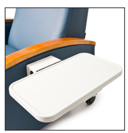
Optional Side Table is mounted to left side of recliner and can be folded down when not being used. (Item: FR597GTBLMNT)