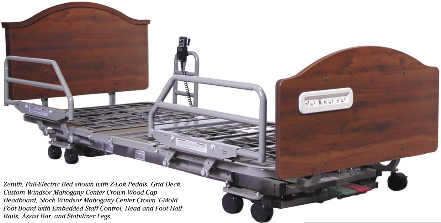
Zenith, Full-Electric Bed shown with Z-Lok Pedals, Grid Deck, Custom Windsor Mahogany Center Crown Wood Cap Headboard, Stock Windsor Mahogany Center Crown T-Mold Foot Board with Embedded Staff Control, Head and Foot Half Rails, Assist Bar, and Stabilizer Legs.