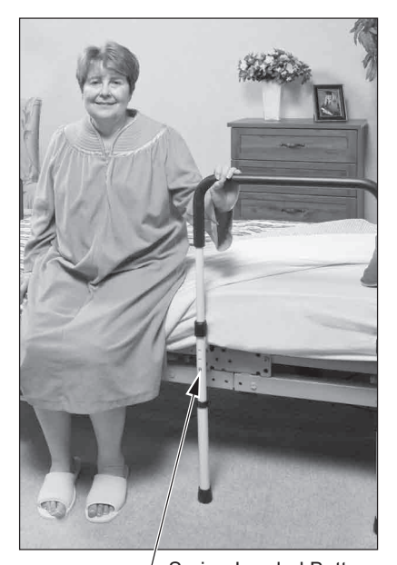
└ Spring-Loaded Button