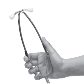
Increase binaural tension (tighten)

To loosen the binaurals , grasp binaurals with both hands above the "Y", as shown at right. Pull binaurals apart gently until the desired tension is achieved.