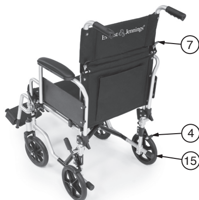
E&J Navigator shown with 8" rear casters only