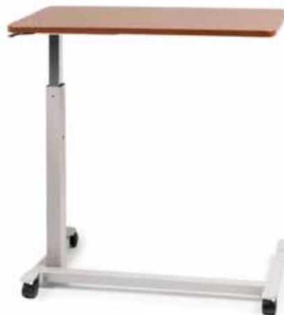
3DL Thermoformed Top