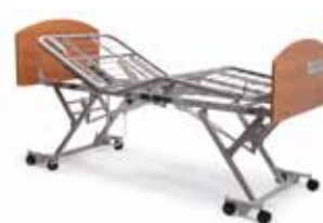
Matrix 4100 Shown with optional four locking casters