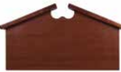
Straight Broken Cap