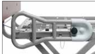
Pivot Assist Device