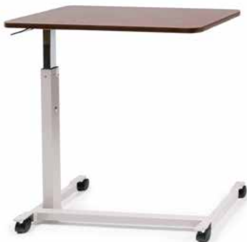
Laminate Top with Vinyl Edges