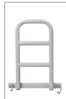
Fixed Assist Devices