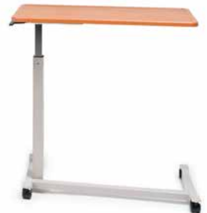
Raised Edge 3DL Thermoformed Top