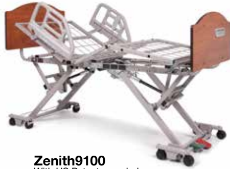
Zenith9100 With US Patent awarded time-saver Hi-Lo system