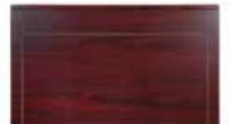
Bull Nose Edge