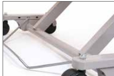
Adjustable Wallsaver (maximum wallsaver protection with optional side-wall bumpers)