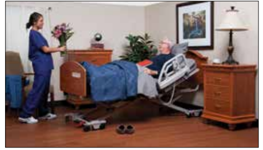
Extended Care Beds