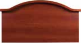
Center Crown with Wood Cap