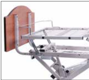
Edema Foot Ratchet

Embedded Staff Control • Angled for better visibility • Two-stage lockouts