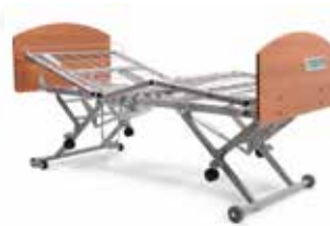
Matrix 5100 Auto-locked/Roll-in-Low