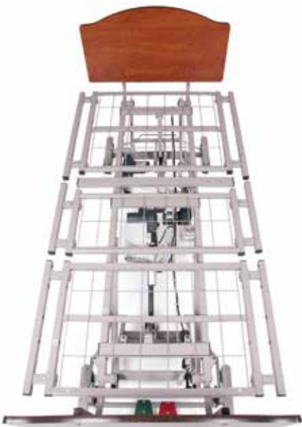
Pin-on Wide Kit