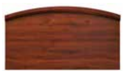
Crescent with Wood Face Trim