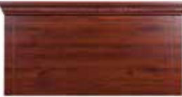
Straight Wood Pediment with Dentil Molding