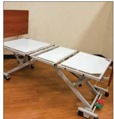
Plastic Pandeck Kit