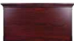
Straight Wood Pediment