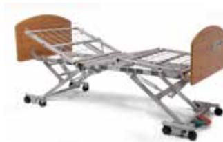
Matrix 6100 Shown with intuitive pedal-lock option