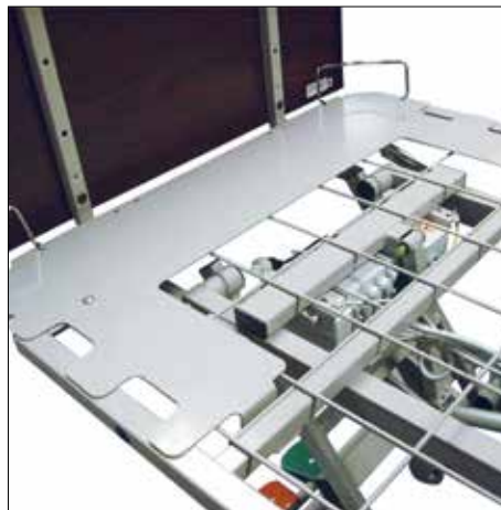
Length Extension Kit