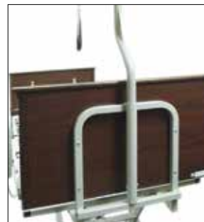
Trapeze and Adapter