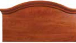
Center Crown with Wood Pediment