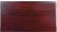
Bull Nose Edge with Vertical Cover Moldings