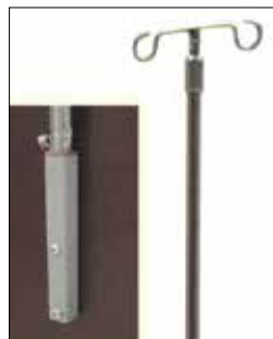
Board Mounted IV Socket