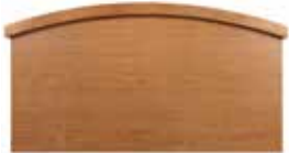
Crescent with Wood Cap