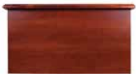
Straight Wood Cap