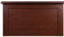
Mission with Wood Cap