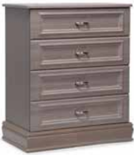
Four Drawer Dresser A37-34