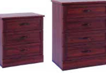
Four Drawer Dresser A37-28