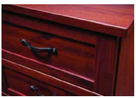
Raised panel door and drawer fronts.

Surface: Laminate Top: 1" thick with 3mm