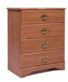
Four Drawer Dresser A37-31