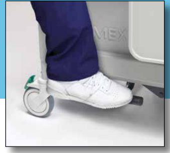
Trendelenburg Position can be actuated from either side of the recliner by a convenient foot pedal