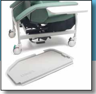
Easily removed side panels for cleaning and maintenance