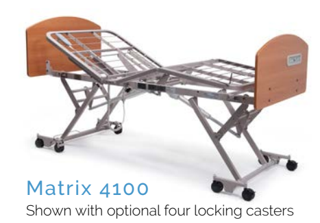
Matrix Series Key Features