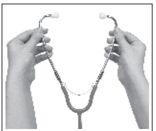
Decrease binaural tension (loosen)