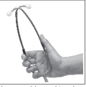
Increase binaural tension (tighten)