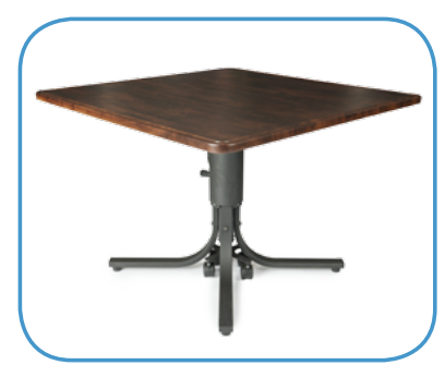
Cocobala spill-reducing table top shown on an adjustable tilt base