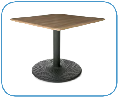
Talas Cherry bullnose table top shown on the checkerboard base