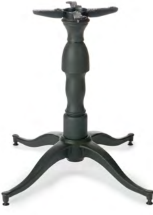
Queen Anne Base *Not compatible with 30" tops