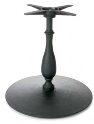
Ornate Cast Iron Base