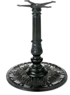
Ornamental Round Base