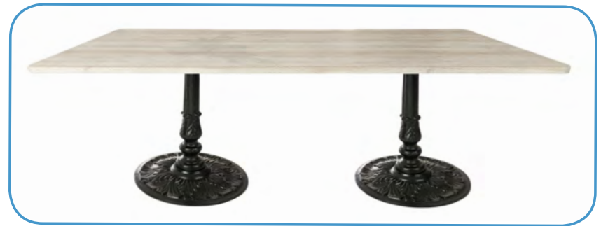
Riviera Oak Nizza flat edge table top shown with a pair of ornamental round bases 'shown in a custom finish

*Lead time for table tops may take 4-6 weeks *Please save this PDF and email it over to your sales rep or project manager