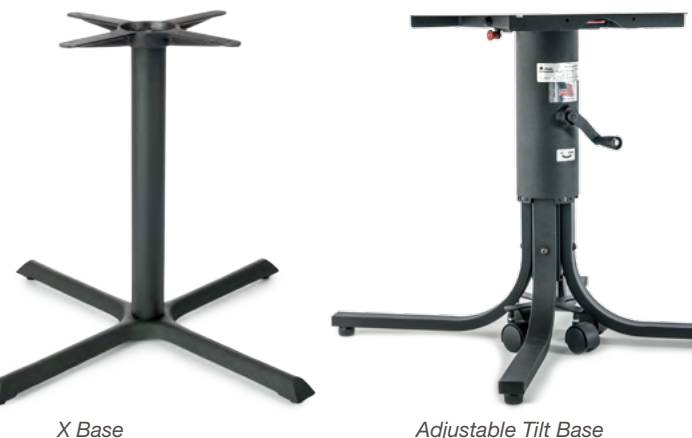
Adjustable Tilt Base (Transport) Adjustable Tilt Base (Non-Transport) *Not compatible with 30" or 36" tops