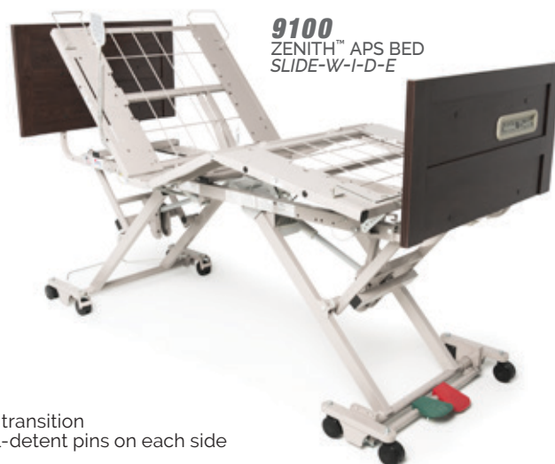
9100 ZENITH™ APS BED SLIDE-W-I-D-E