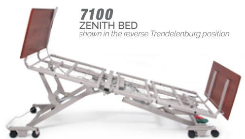
7100 ZENITH BED shown in the reverse Trendelenburg position