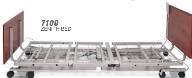
7100 ZENITH BED