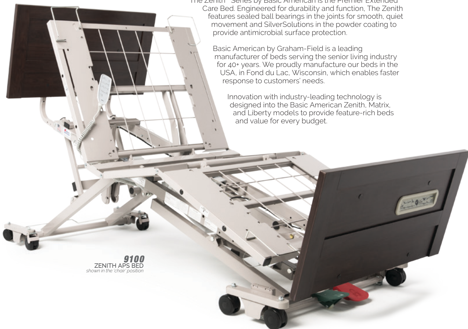
9100 ZENITH APS BED shown in the 'chair' position

The Zenith™ Series by Basic American is the Premier Extended Care Bed. Engineered for durability and function, The Zenith features sealed ball bearings in the joints for smooth, quiet movement and SilverSolutions in the powder coating to provide antimicrobial surface protection.