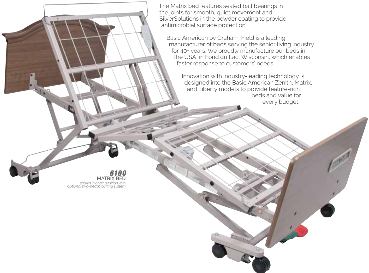
6100 MATRIX BED shown in chair position with optional two-pedal locking system

Innovation with industry-leading technology is designed into the Basic American Zenith, Matrix, and Liberty models to provide feature-rich beds and value for every budget.