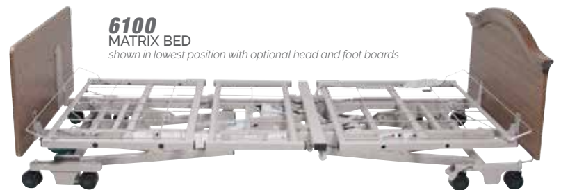
6100 MATRIX BED

shown in lowest position with optional head and foot boards