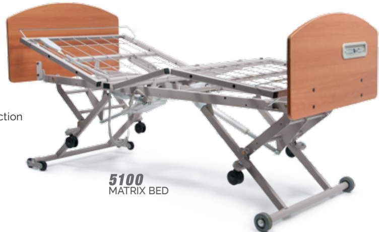
5100 MATRIX BED