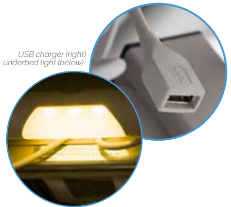
USB charger (right) underbed light (below)