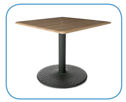
Talas Cherry bullnose table top shown on the checkerboard base