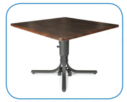
Cocobala spill-reducing table top shown on an adjustable tilt base