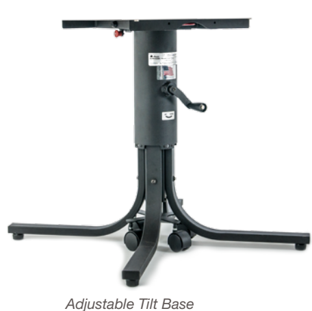
(Transport) Adjustable Tilt Base (Non-Transport)