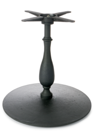
Ornate Cast Iron Base