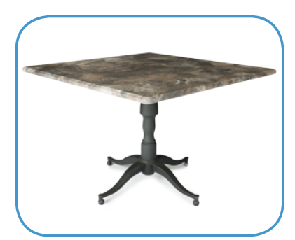
Stormy Black double waterfall table top shown on the Queen Anne base 'shown in a custom finish

GF Health Products, Inc. is an ISO 13485:2016 / MDSAP Certified Company