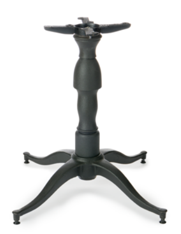
Queen Anne Base *Not compatible with 30" tops