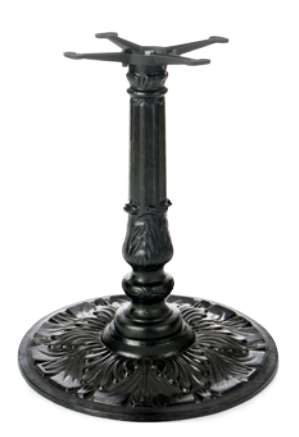
Ornamental Round Base