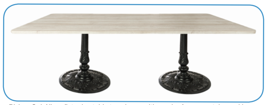
Riviera Oak Nizza flat edge table top shown with a pair of ornamental round bases 'shown in a custom finish