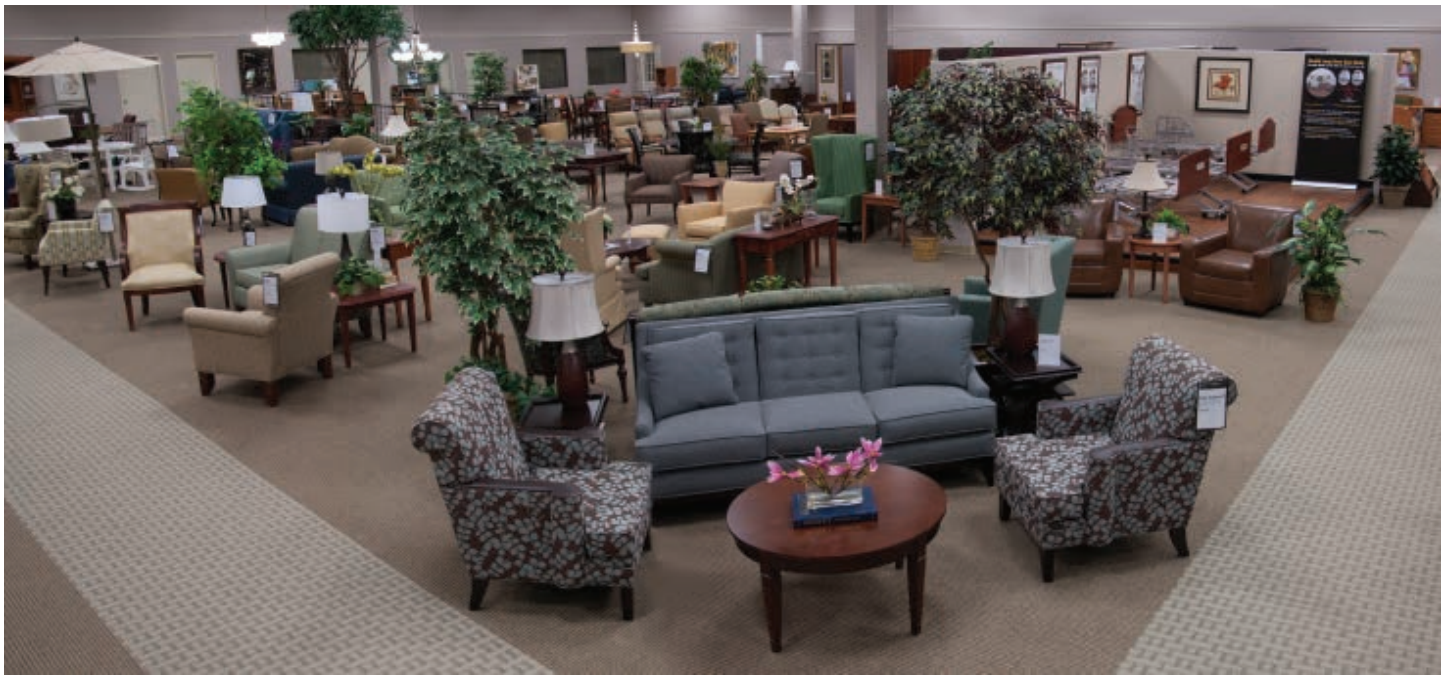
10,000 square foot showroom