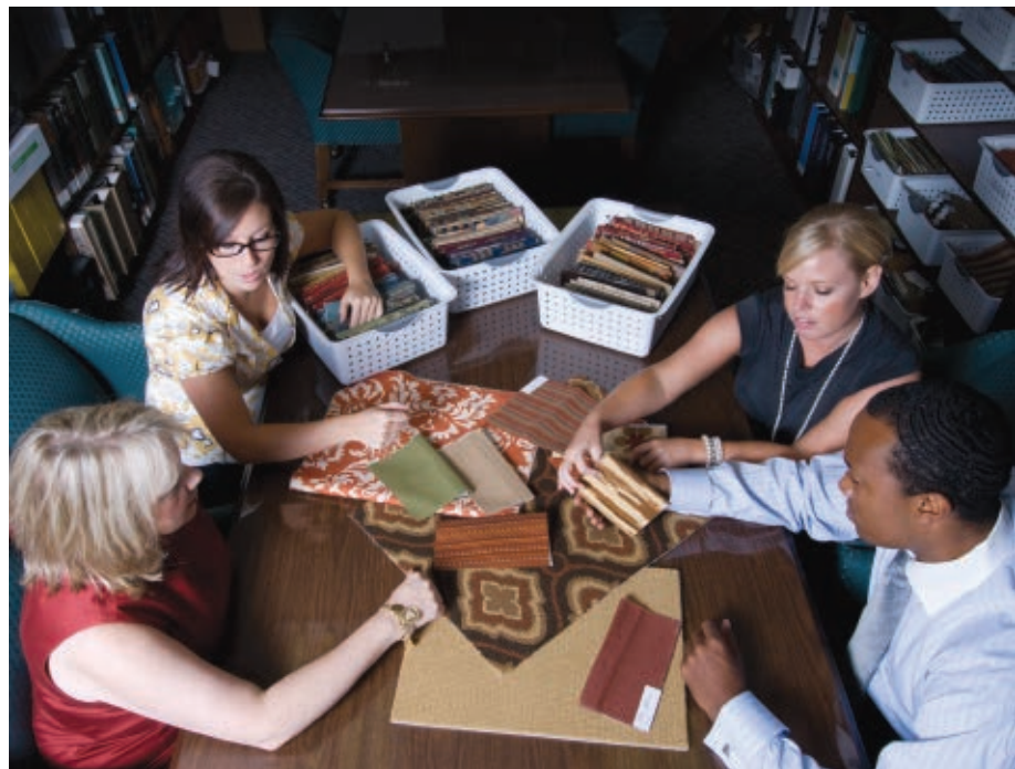
Full in-house library