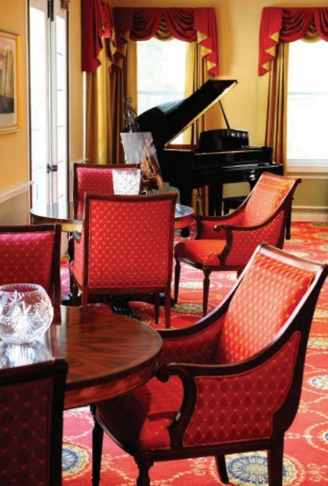
Award winning designs