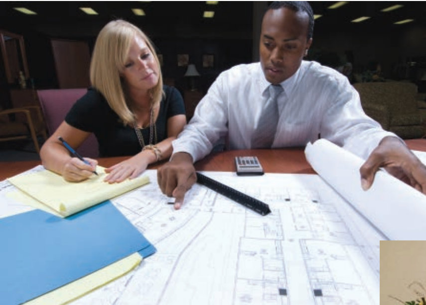
Turn-key project management for New Construction & Renovations

Our designers are healthcare experts, focusing on design that enhances resident comfort and wellness. Our team can help create a warm, home-like environment that your residents and their families are sure to enjoy. Detail-oriented and aware of codes and regulations, we create safe and distinct spaces that meet both your functional and financial requirements.